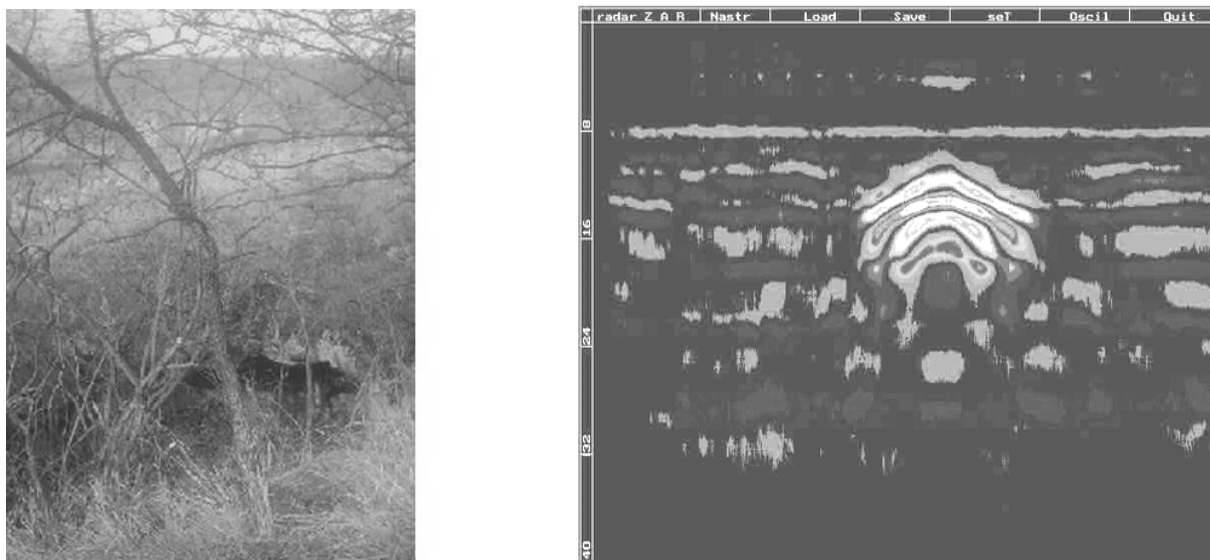
Fig. 1. Picture of terrestrial georadar

Aerocosmic georadar sounding is a relatively new method for remote observation. Currently, this method is used in the systems of agricultural and ecological monitoring and it can be used in more systems.